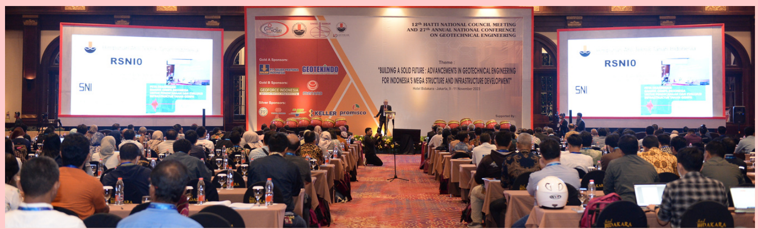
27th Annual ISGE Conference