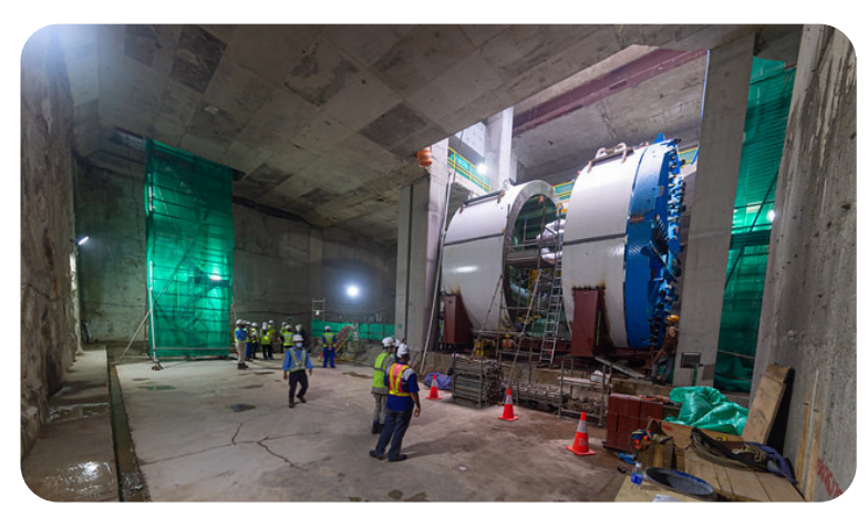
CP 203 - GLODOK MRT STATION

The Jakarta MRT construction Phase 2A is a 5.8 km MRT line consisting of 7 stations: Thamrin, Monas, Harmoni, Sawah Besar, Mangga Besar, Glodok and (Beos). contract The is valued approximately IDR 4.6 trillion (USD 280 million) and has a construction timeline of 72 months (September 2021 – August 2027). The Jakarat MRT Project aligns with the old city planning concept, emphasizing development of pedestrian area and traffic engineering management.