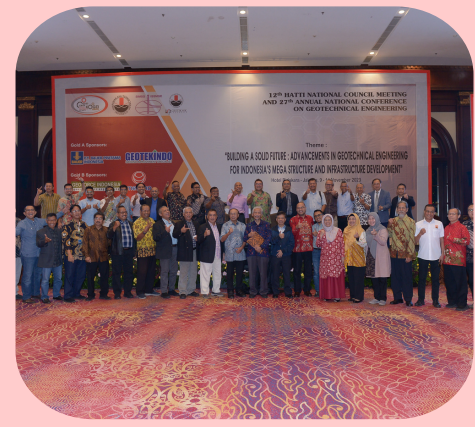
Indonesian Geotechnical Congress